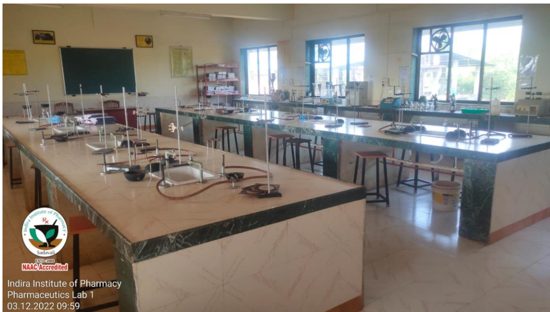
Indra Institute of Pharmacy Pharmaceutics Lab 1 03.12.2022 09:59