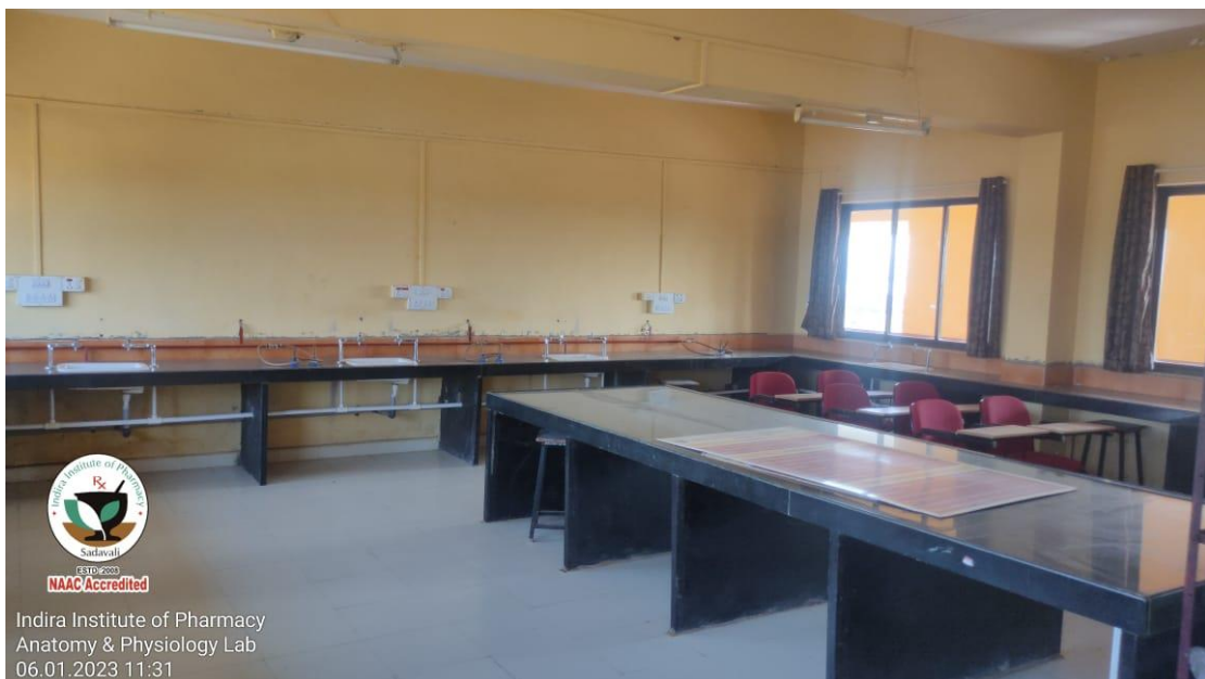
Indira Institute of Pharmacy Anatomy & Physiology Lab 06.01.2023 11:31