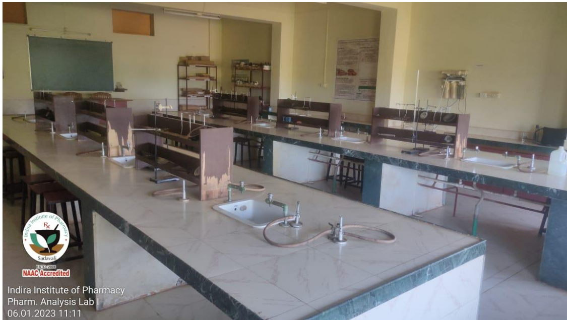
Indra Institute of Pharmacy Pharm. Analysis Lab 06.01.2023 11:11