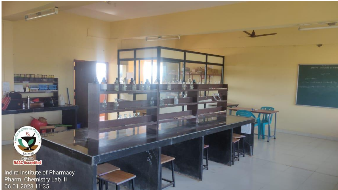
Indira Institute of Pharmacy Pharm. Chemistry Lab III 06.01.2023 11:35