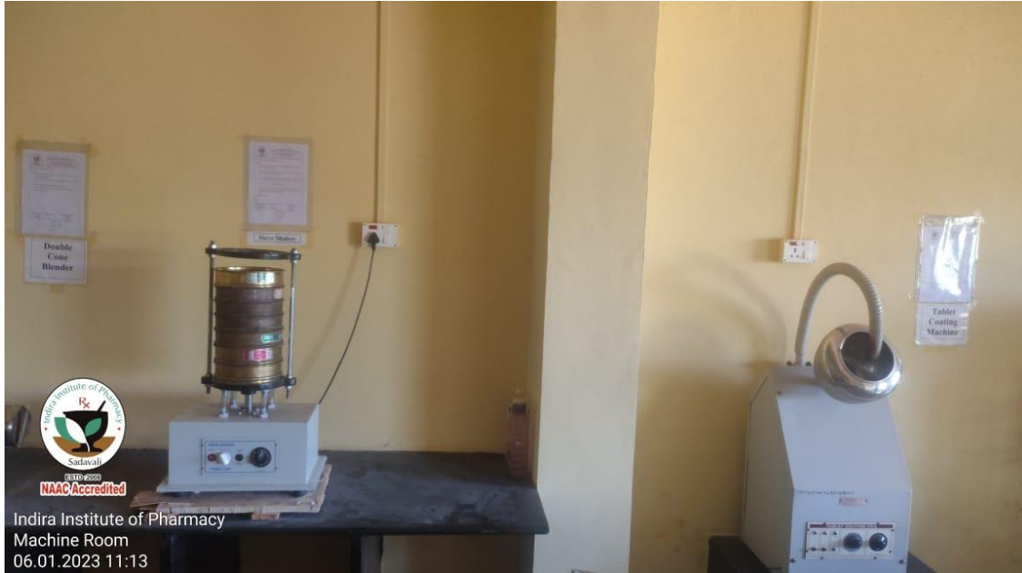
Indra Institute of Pharmacy Machine Room 06.01.2023 11:13