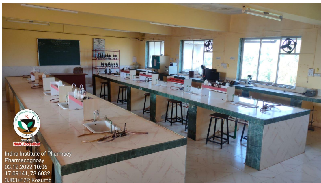
Indira Institute of Pharmacy Pharmacognosy 03.12.2022 10:06 17.09141, 73.6032 3JR3+F2P, Kosumb