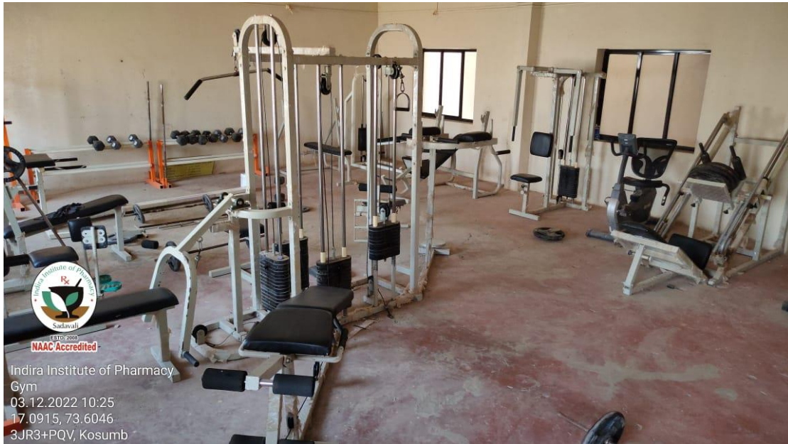
Indra Institute of Pharmacy Gym 03.12.2022 10:25 17.0915, 73.6046 3JR3+PQV, Kosumb